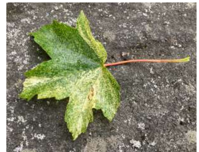
Variegated sycamore leaf

A cultivar of Sycamore, planted for its variegated leaves with cream splashes.