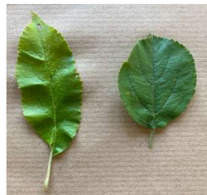
L - Orchard apple, R - Crab apple

Look over to Wells Rd. The largest tree at the roadside is 5, on its right, 6 and right of that 7