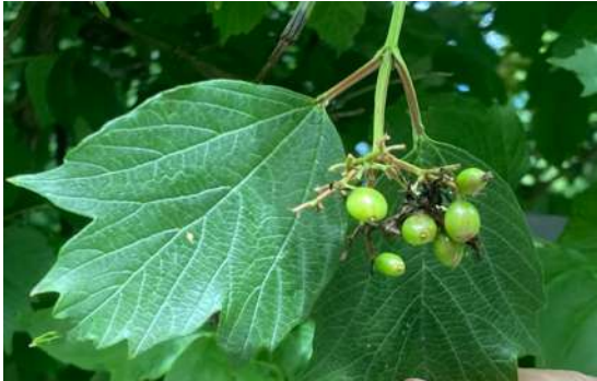
Guelder rose leaf with developing berries

A native shrub and an indicator of ancient woodland, but there are also many cultivars, widely planted in gardens for the creamy-white flowerheads and bright red berries. Its berries are mildly toxic if eaten raw but they can be cooked to make jelly or jam. The leaves have 3 lobes and the leaf stem has a channel down the middle. The name 'guelder' comes from the Dutch province of Guelderland.