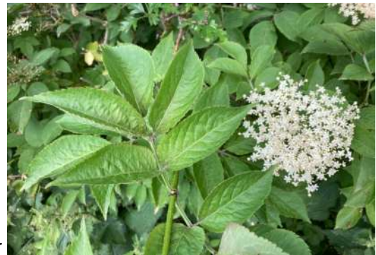
Elder leaf and flower

Continuing up, next on your right are two trees growing together, 14 and 15