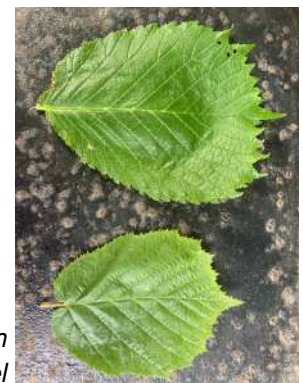
Top - Wych elm Bottom - Hazel

Continue and just after another lamppost on your right take the sandy path on the left. On your left, after a rowan tree, and about 5m from the path is 33