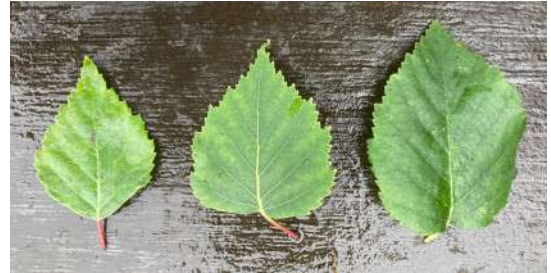
L-R; Downy, Silver, Paperbark birch leaves