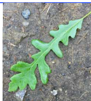
Turkey oak leaf and acorn

Non-native, introduced from Europe in 18th C. Not so useful for wildlife as native oak and is host to the Knopper gall wasp whose larvae damage the acorns of native oaks. The leaves are slender and variable in outline. The acorn is quite different to the native oak – it has a hairy cup.