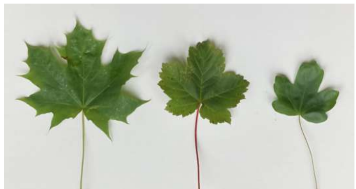
L- Norway maple, Mid- Sycamore, R- Field maple

Continue along the path. On the right, just before three steps leading up to a bench is 25