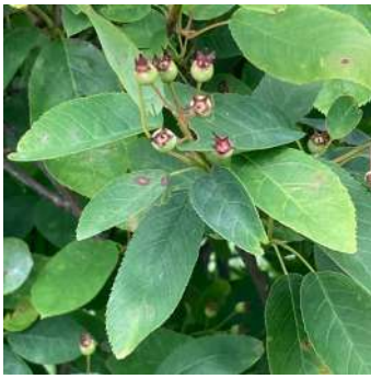
Juneberry leaves and developing berries