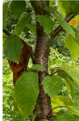
Cherry bark and leaves

Another unusual tree for the moor and probably also brought here by a bird. The bark is distinctive - dark reddish brown with cream -coloured horizontal lines called lenticels. The leaves are large and have coarse teeth. This tree does produce cherries but like the Juneberry these disappear very quickly.