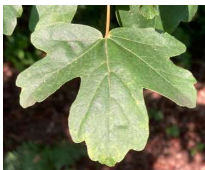
Field maple leaf

Native. The leaves have 5 lobes and can be mistaken for sycamore but are smaller, darker green and shiny, and have just a few, rounded teeth. The fruits are similar too, but the two wings are almost in a straight line, not angled towards each other as in sycamore.