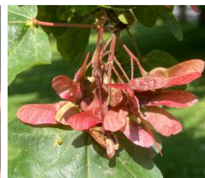
Field maple - winged fruit

At tree 7 continue up the road. Hanging over the Darwin Gardens board, planted at the end of a hedge together with a hazel, is 8