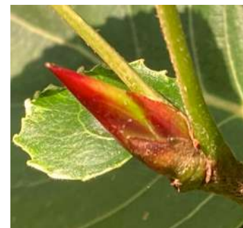
Balm of Gilead leaf bud