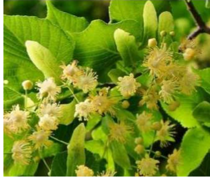
Small leaved-fruits/flowers in all directions