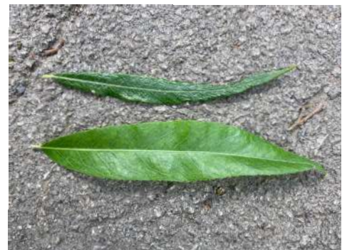
Top - common osier Bottom - weeping willow

Continue up the road, passing the two ponds of Wells House, and turn left into White Wells carpark. In the left hand corner of the carpark is 11