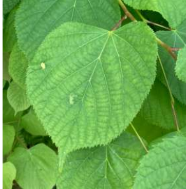
Small leaved lime

This tree was cut down in 2024 but is sprouting from the base and trunk Native to South and Central England. Our other native limes are large leaved and common lime. All three have heart shaped leaves with a lopsided base. Those of the small leaved lime tend to be smaller than those of the other two but leaf size is not helpful in distinguishing them. The flowers and fruits of the small leaved point in all directions, some directly upwards, whereas the other two have flowers and fruits that always hang down. Both small leaved and common lime have a forest of shoots around the base of the tree.