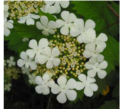
Guelder rose flower

Walk a short way down Brodrick Drive. To the left of the second lamppost, leaning to the left and with a major branch lost to a winter storm is 9. In the grass, towards the main road is another willow, 10