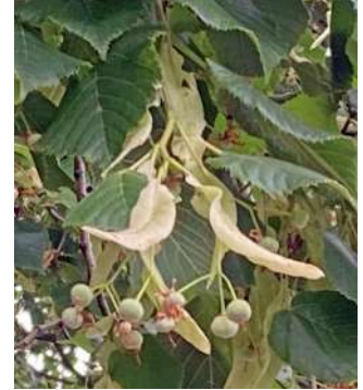
Common- fruits hang down

Further on, on the left just before three large rocks surrounding a bench is 26