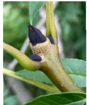
Ash leaf buds

There is a small hawthorn after the ash and then as you continue up the track the next large tree on the left is 13