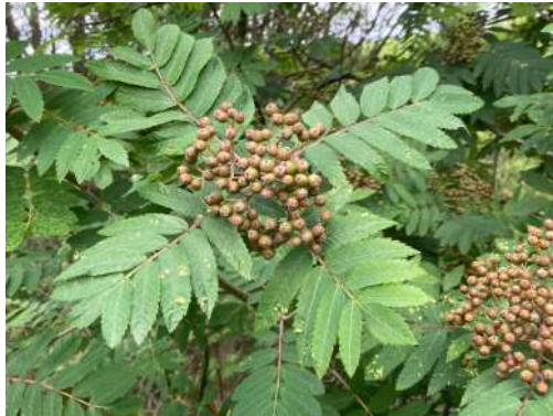
Rowan leaves and developing berries

Native. Common in the wild in the North and West and plentiful on Ilkley moor. It is also often planted in streets and gardens. The leaves consist of 4-8 pairs of toothed leaflets with another leaflet at the end. Once pollinated, its clusters of creamy-white flowers develop into red berries, valuable to birds and they can also be made into a jelly. Although sometimes called ‘Mountain ash’ because it can grow at high altitudes, it is no relation of the Ash tree.