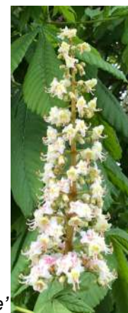
Horse chestnut ‘candle’