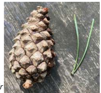
Scots pine cone and needle pair

Native to Scotland. The leaves are short needles (5-7cm), often twisted, and always growing in pairs. The bark is orange-brown, particularly towards the top of the tree. The current year's cones are green. These mature on the tree the following year, becoming grey-brown with a circular bump in the middle of each scale.