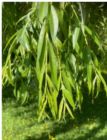
Leaves and shoots