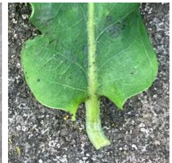
Backward pointing 'ears' and short stem