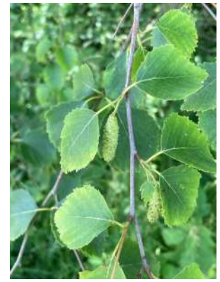
Downy birch leaves and catkins

The native birch of the North. It is a very hardy tree, one of the first to become established in Britain at the end of the Ice Age, and is known as a pioneer tree – it rapidly colonises heathland, beginning the process of conversion to woodland. Young birch are plentiful on the lower slopes of the moor. Downy birch is similar to silver birch (20), and often hybridises with it, but its leaves are more rounded, are a duller green and feel rough. The young twigs are hairy.