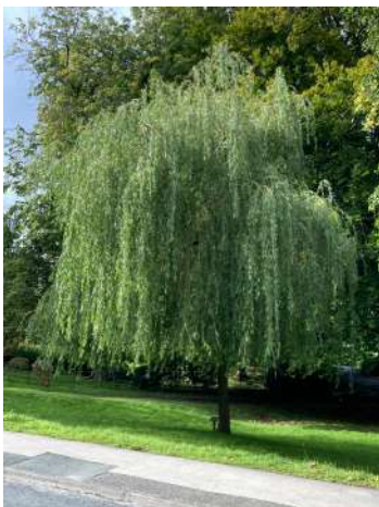
Golden Weeping Willow

This is a commonly planted hybrid of Chinese weeping willow and Golden willow. The yellow shoots are very long and hang down straight. The leaves are a similar shape to the common osier but are broader and a much brighter green.