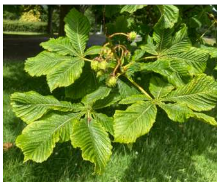
Horse chestnut leaves and conkers

Non-native – came to the UK from Turkey in the 16th C. The leaves are made up of 5-7 large leaflets. It has large sticky red-brown buds in spring, ‘candles’ of flowers in May and the fruits are brown conkers inside a spikey green case.