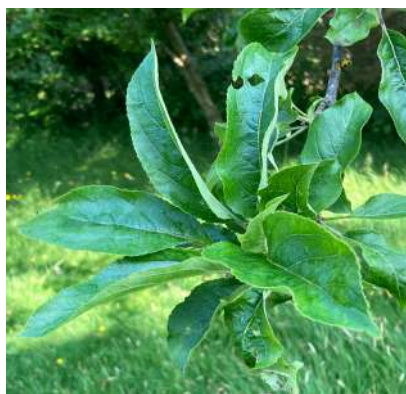
Orchard apple leaves

Originally from central Asia, unlike the crab apple, which is native. The orchard apple has hairy stems and the leaves are thinly woolly underneath. The fruits are larger and the leaves longer and less rounded than those of crab apple.