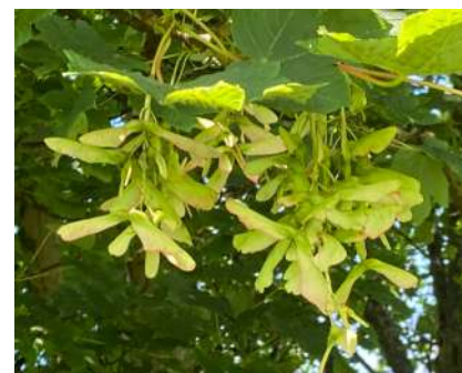
Sycamore - winged fruits