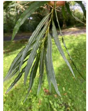
Common osier leaves

A small willow, native to S E England, now widespread throughout the UK. Usually found in wet places and along riverbanks. The leaves are very long, thin and pointed, glossy and dark green above with felt-like silvery hairs beneath. The leaf edges are finely toothed and slightly rolled inwards. Its long flexible stems (called withies) have traditionally been used to make baskets. Now, because of the ability of willow to absorb heavy metals it is planted to 'clean up' contaminated waste ground.