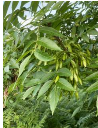
Ash leaves and winged fruits

Ash leaves are made up of 9-13 long leaflets and can be confused with Elder (14) and Rowan (17), but the tree is easy to identify, even in winter, as it has black leaf buds. The winged fruits hang like a bunch of keys. Ash die-back is affecting most of the ash trees in Ilkley and is causing devastation in the Dales – you will see diseased trees later in the walk, but this one looks healthy.