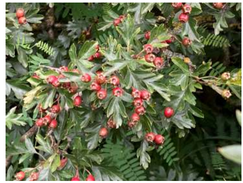
Hawthorn leaves and haws

Walk through the carpark and stop at the White Wells Bath House sign. From here you get a good view of the trees on the moor. They are mostly fairly small, are scattered all over the moor, and consist mostly of self-sown Hawthorn (11), Elder (13), Birch (15) and Rowan (16). Straight ahead in the distance you can see a conifer wood – these are mostly Scots pine (30) and were planted in late Victorian times.