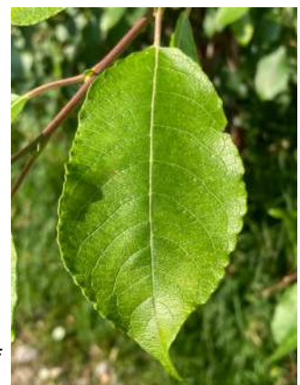
Goat willow leaf

Also known as pussy willow as the male catkins look like a cat's paw. These appear before the leaves. The leaves are more oval than other willows (see 9, 10) and the tip twists sideways. The underside of the leaf is a felted grey-green. Willows like wet ground, but goat willow can grow in drier conditions than other willows.