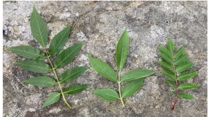
left - Ash, middle - Elder, right - Rowan

Continue towards White Wells and stop at the junction with a grass path a short way before the small wood ahead, planted to conceal the toilet block. In the wood are sycamore, beech, and on the R hand side a single, rather poor specimen of Larch, 17. To see the larch take the grass path (rough, often wet). Otherwise continue straight