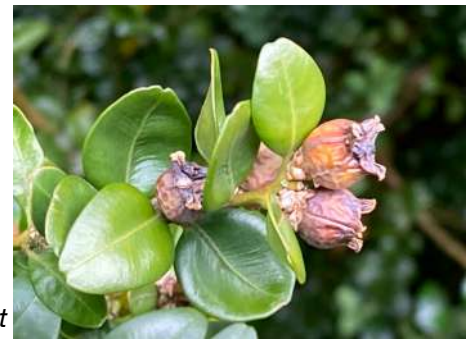
Box leaves and fruit

A native evergreen with small oval, shiny, leathery leaves, often notched at the tip. Grows well on chalk slopes, such as Box Hill in Surrey, named after the tree, but is planted all over the UK as hedging (as here) and for topiary (as at Levens Hall, Kendal). All parts of the boxwood plant are poisonous.